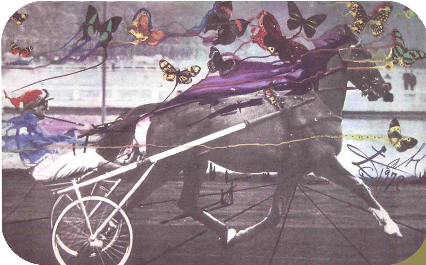
REPRODUCTION - POSTCARD, 1972 BY SALVADOR DALI