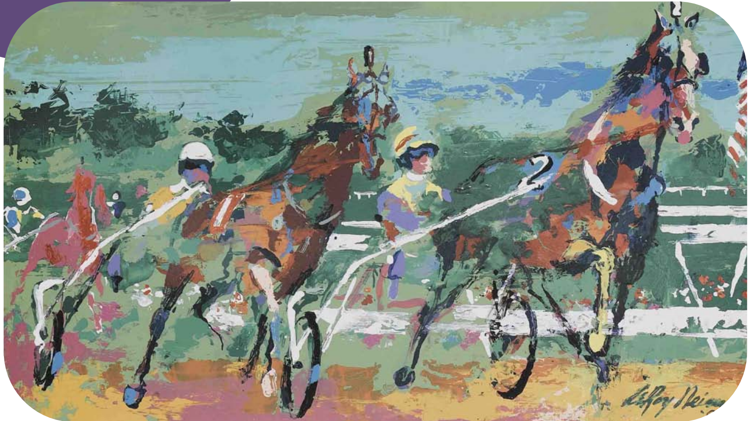
PRINT ON PAPER, 1995 BY LEROY NEIMAN