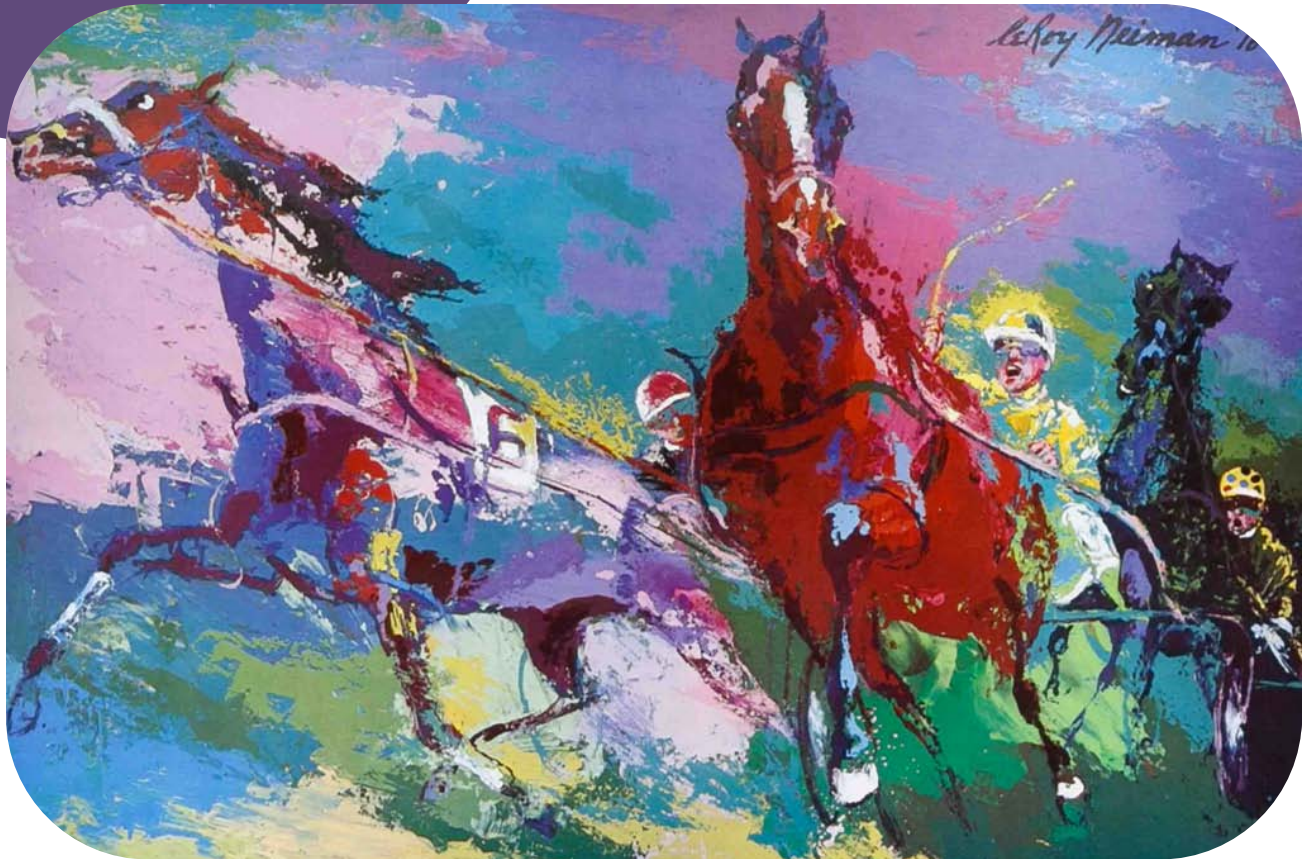
PRINT ON PAPER, 1976 BY LEROY NEIMAN