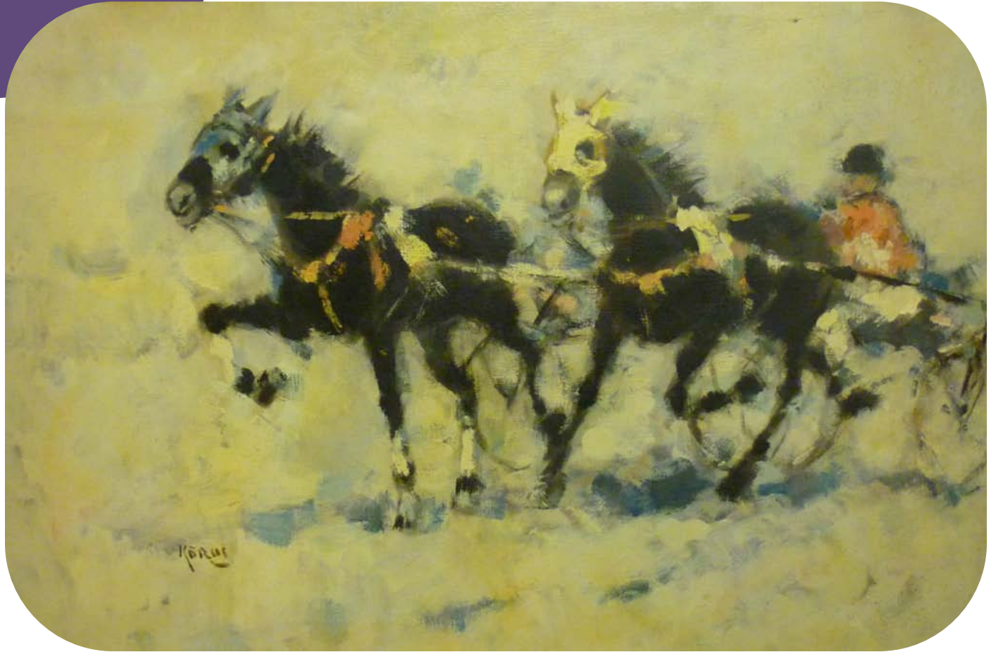
OIL ON CANVAS, 1970 BY A. KÖROS