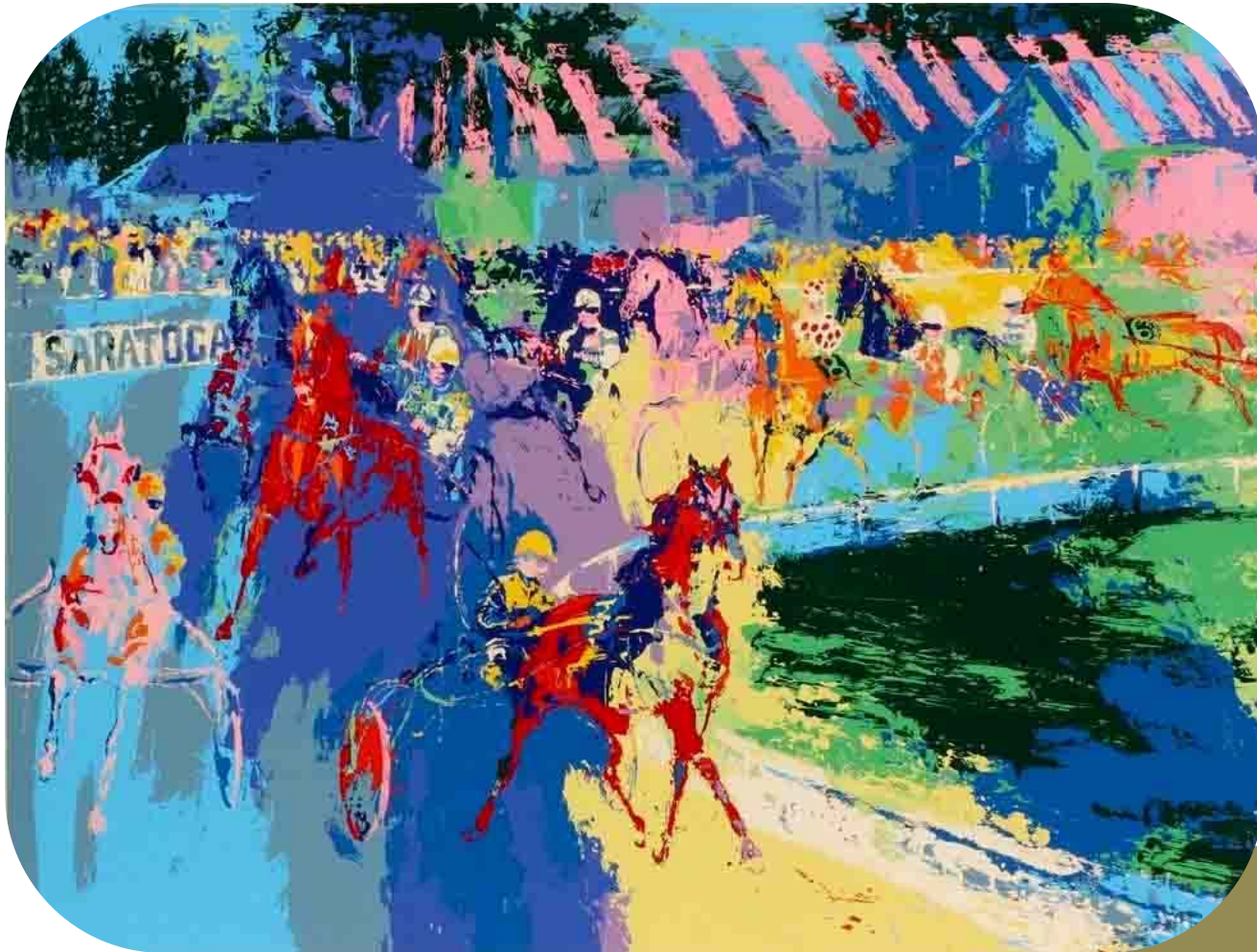
SERIGRAPH, 1969 by LEROY NEIMAN